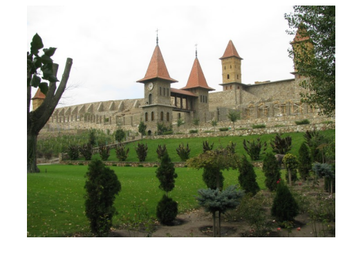
Loga park is worth visiting!